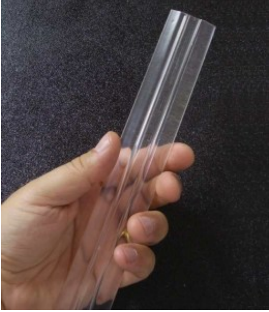
Part #172-49 49" Hinge Original Price $7.00 Tax amount